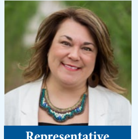
Representative Kristen Cloutier

Representative Cloutier led a legislative effort to include a $5.1 million allocation in the state's ARP spending plan for a Family Caregiver Grant pilot program. This program aims to help families alleviate costs associated with providing in-home care of an adult with $2,000 annual grants to caregivers.